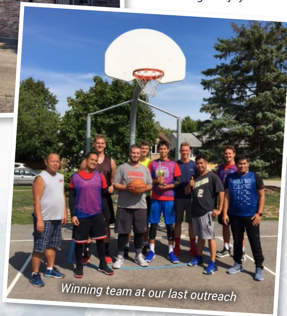
Winning team at our last outreach