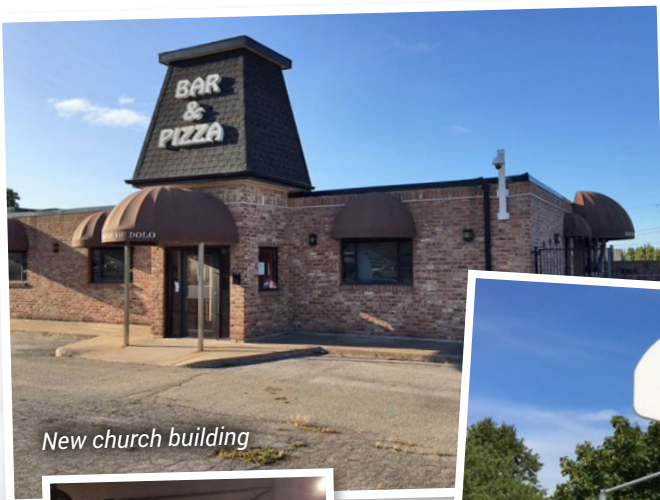
New church building

Rich Bultje can be reached at: rybultje@gmail.com